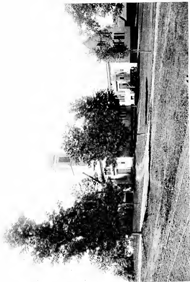
CONGREGATIONAL CHURCH, NEWINGTON, IN THE REAR OF WHICH IS THE GRAVEYARD